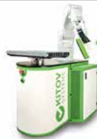
KITOV REVIEW STATION