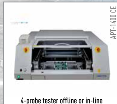
4-probe tester offline or in-line