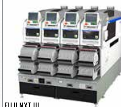
FUJI NXT III