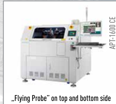
„Flying Probe“ on top and bottom side