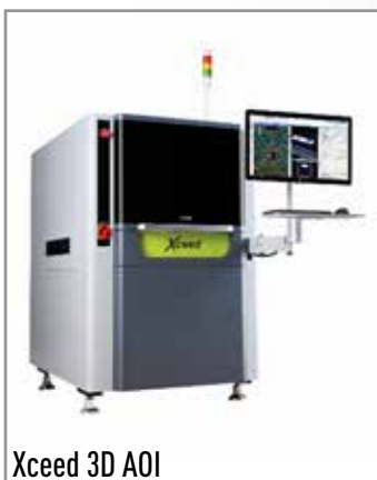
Xceed 3D AOI