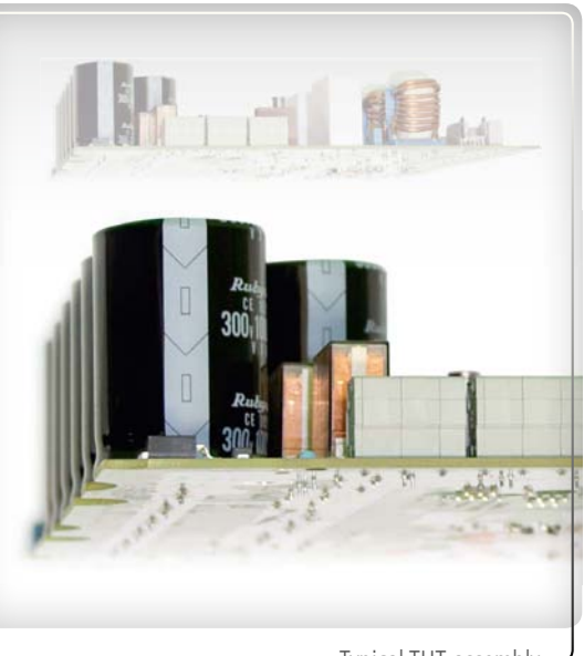
Typical THT assembly